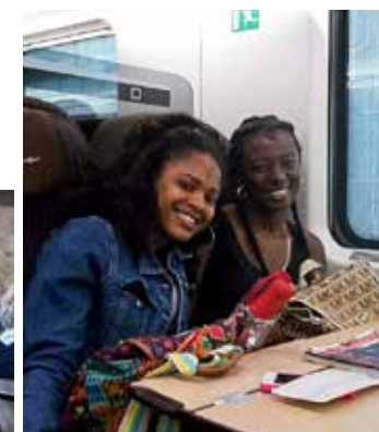
Below: Students enjoy the train ride to Ostia Antica.