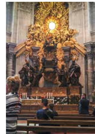
Above: A gorgeous stained glass window with the Holy Spirit depicted in the center illuminates the altar area in St. Peter's Basilica at the Vatican in Rome, Italy.