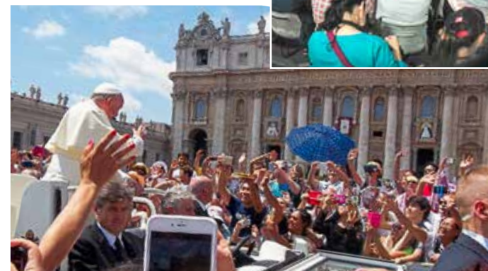
Right: A quick glimpse of Pope Francis as he passes by