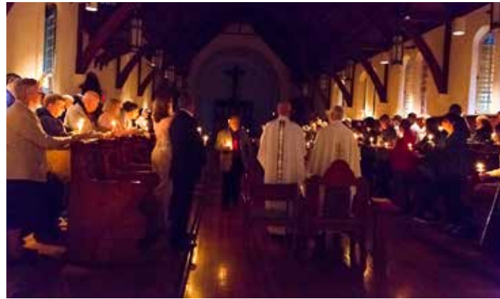
The beauty of St. Elizabeth's Chapel shined during a candlelit Easter Vigil Mass where worshipers passed the light to one another, symbolic of passing on the light of the Risen Christ. The candles were used at various times throughout the Saturday evening Mass.