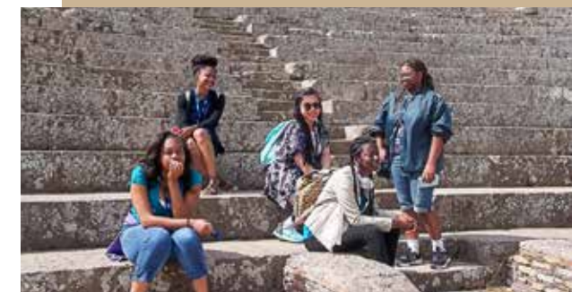
Above, right: Students sit on the ancient steps of the Theater at Ostia to take a break from their touring and lessons.