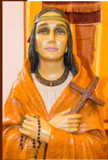
Left: Images/depictions of St. Kateri Tekakwitha often include a cross made of branches since she often would make handmade crosses from twigs and hang them throughout the woods in which she traveled.