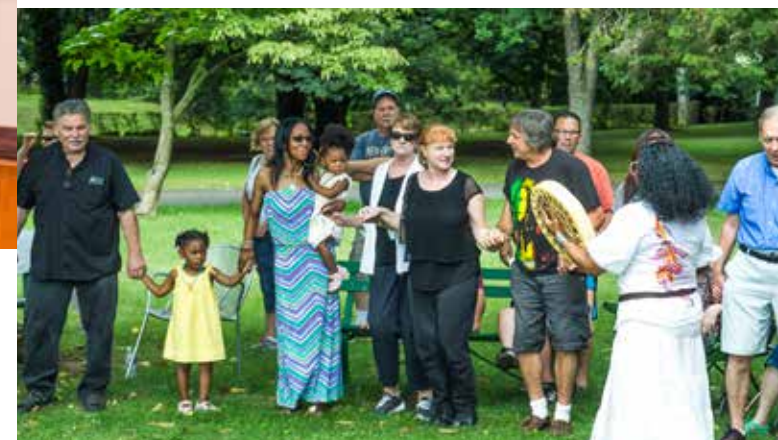
Above: People of the community were united together as they held hands to participate in one of the songs.