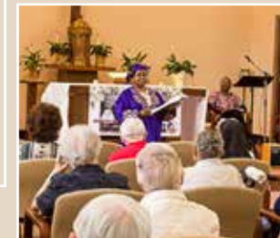
The Storytelling Ritual reflected back on some of the experiences at the Motherhouse as well as some of the Sisters' tales from their ministries elsewhere.