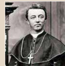
Bishop James Augustine Healy