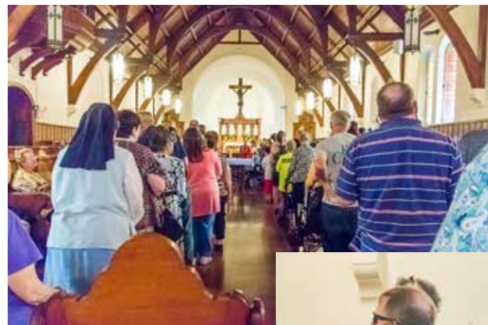
Right: A blind man was escorted by a companion to St. Elizabeth's Chapel. He sat and waited until the line lessened so that he could receive a blessing from one of the Native American Sisters of the Blessed Sacrament during the healing ceremony held at the end of the day.