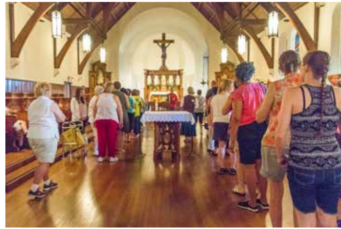
Above: Regardless of race, age, or religious beliefs, people lined up to participate in the ceremony in hopes to find peace and healing.