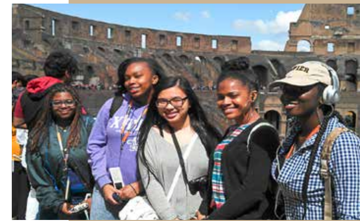
Above: Summer Course Students tour the Roman Colosseum as part of their course studies in Theology.