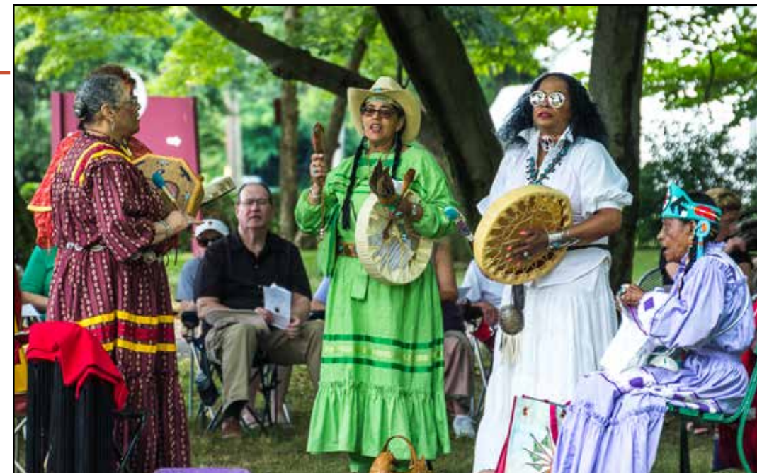
Above: Members of the Southeastern Cherokees provide a musical rendition of the Our Father.

The outdoor circle of ceremonies included the traditional blessings,