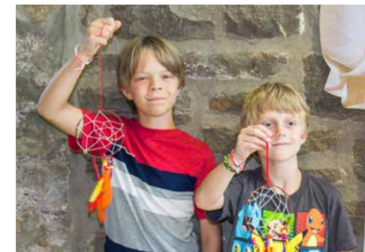
Above: Two brothers proudly show off their dreamcatchers.

“Have a cordial respect for others in heart and mind; if there is any prejudice in the mind we must uproot it, or it will pull us down.”