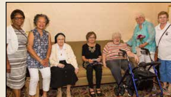
Left: A gathering in the hallway as groups of Associates and Sisters meet up and stop to chat. To view more photos click here .