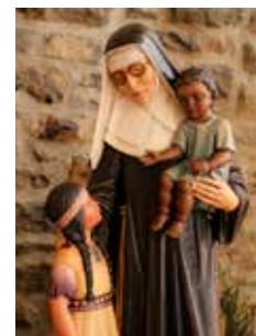
Above: Statue of St. Katharine Drexel outside of Gift Shop area of Shrine.