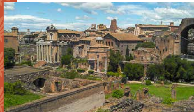
Above: An overhead view of the ancient ruins of the Roman Forum in Rome, Italy.

The group also enjoyed a daytime visit to the Roman Forum, and then a few days later, came back to the Imperial Forum of Augustus for a night sound and light show that gave them a sense of what those buildings would have looked like in the time of Augustus.