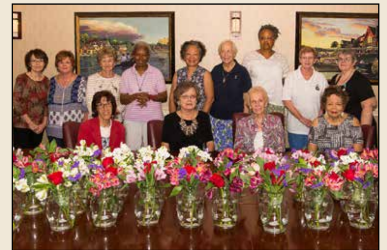
Above: The Bensalem Chapter of the SBS gathered at Paul's Run to visit with the Sisters of the Blessed Sacrament who live at or are being cared for by the staff of Paul's Run Retirement Community.

On Sunday afternoon, August 6, 2017, the local ASBS met in a conference room to discuss the plan for visiting with the Sisters who are residents of Paul's Run. Lovely vases of colorful flowers covered the table and were distributed to the SBS during their visits. Hugs, smiles and joyfulness filled the halls.