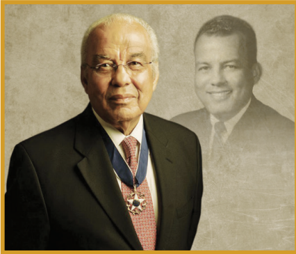
The New Orleans ASBS Faith Community

President Emeritus of Xavier University of Louisiana